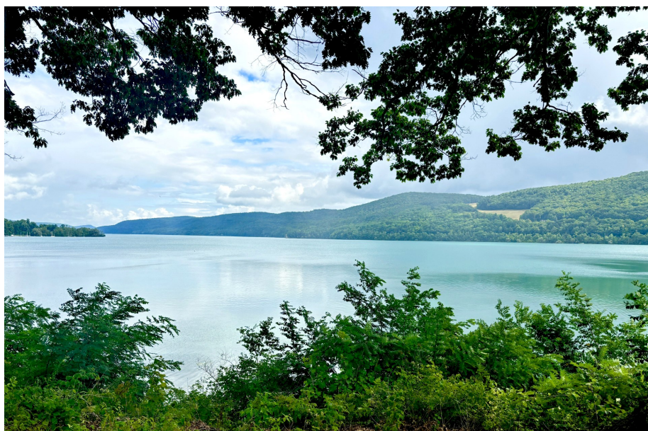
Photo of Otsego Lake, Cooperstown, NY