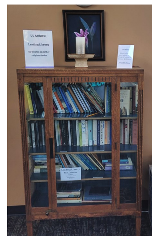
Emerson Room cabinet

Used Books for Sale are on the white built-in shelves in the Library/Living Room. Most of the fiction titles have been reviewed and are 2011 or newer. Suggested donation is 50 cents for paperbacks and $1.00 for hardcover. There is a metal strongbox to leave cash in and QR codes posted to pay by credit card. All proceeds benefit Amherst Little Free Pantry.