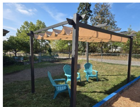
A shady spot in the playground

It is truly a "UU Miracle." In eighteen months we have gone from zero faith development staff and zero children to a half-time Director of Faith Development (DFD), 2 part-time FD support staff (Molly & Kyla), a cadre of dedicated "extra pair of hands" volunteers, and 24 children and youth registered in the program! And we are still growing! Can someone give me a "Hallelujah!?! *"