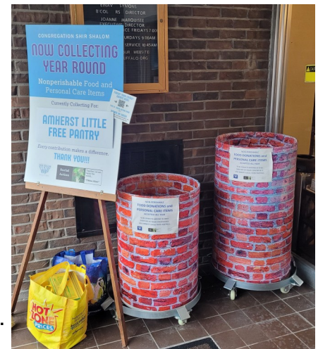
Food collection at Congregation Shir Shalom