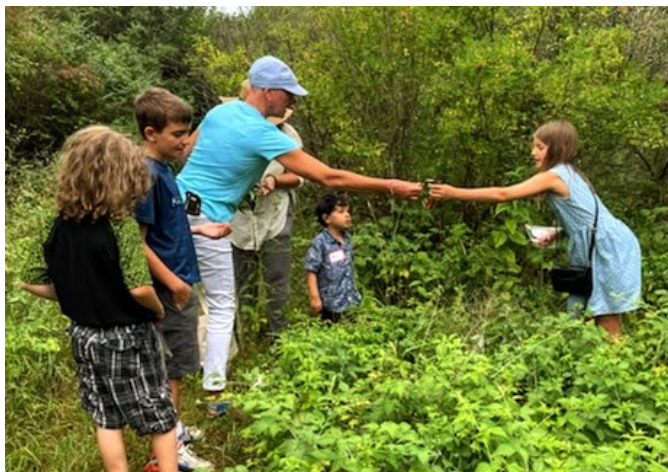
FD Ecology Center exploration Sunday, July 24th.