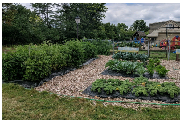
Garden beds before planting and after.