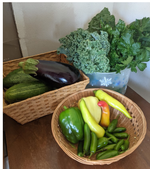
Fresh produce from the UU Amherst gardens