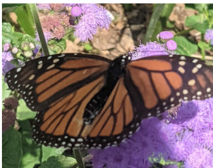
Monarch butterfly on Ageratum in the entrance garden.