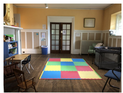
New Faith Development room located in the Admin Wing.